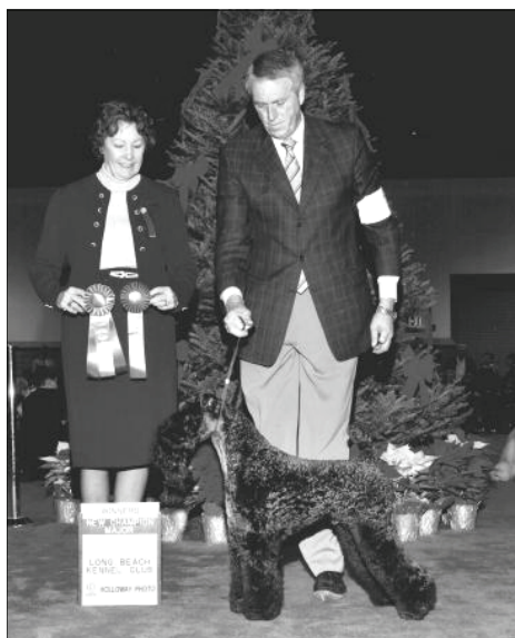
Winners Dog Southern California Specialty