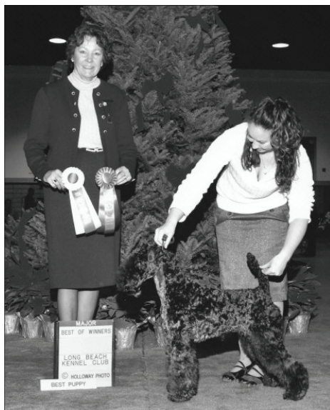
Best Puppy, Winners Bitch, Best of Winners Southern California Specialty