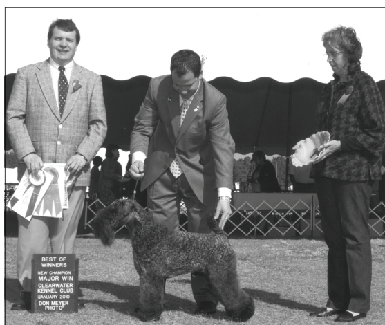
Winners Dog, Best of Winners KBTC Central Florida Specialty