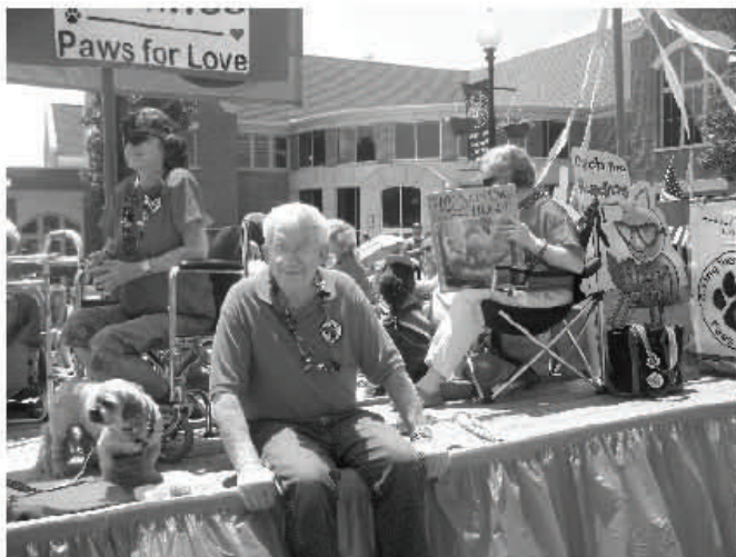
"Kerry It Forward:" Therapy and Service Kerries- Quietly Giving Back to Society One Paw at a Time