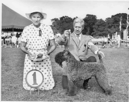
The Kerry-ach F.R. Carshla